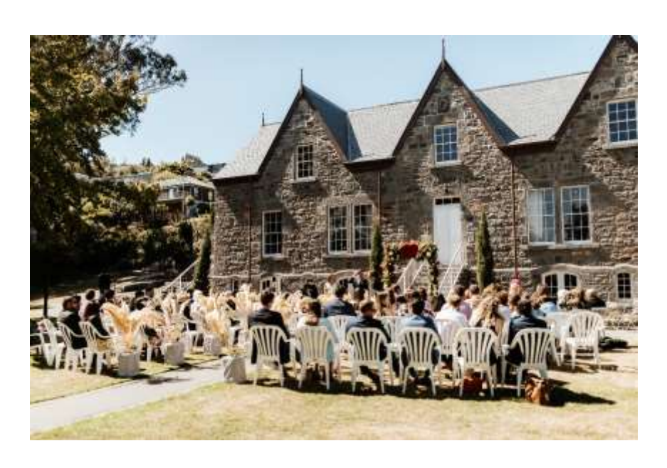
'Your day, your way'

30 Shalamar Drive Cashmere, Christchurch 8022 T: 027 622 1745 | E: bookings@theoldstonehouse.co.nz